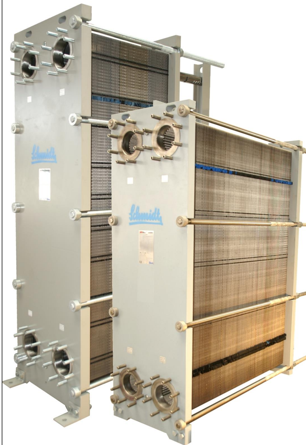
SIGMA M76 / M96 PLATE HEAT EXCHANGER